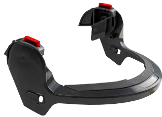
251-HP1491B Replacement Faceshield Bracket