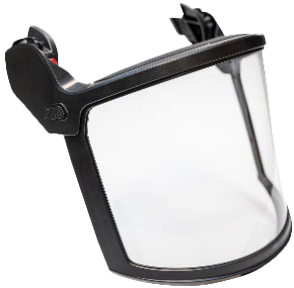
251-HP1491PFS Polycarbonate Faceshield Set