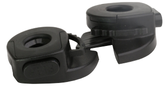
251-HP1491PC Replacement Eye Shield Protector Connector