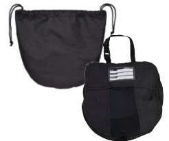
280-HP1491BAGB Basic Storage Bag