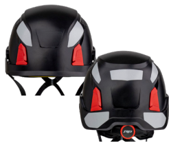
280-HP1491KIT Reflective Decal Kit