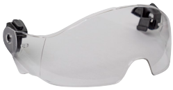
251-HP1491C Eye Shield — Clear