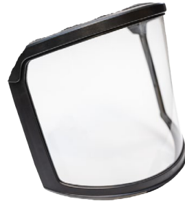
251-HP1491PF Replacement Faceshield Polycarbonate