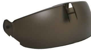
251-HP1491P Eye Shield Protector Smoke