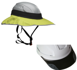
280-HP1491FSUN 360 Degree Fabric Sunshade