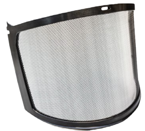
251-HP1491MF Replacement Faceshield Metal Mesh