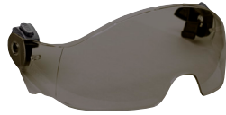
251-HP1491G Eye Shield — Gray