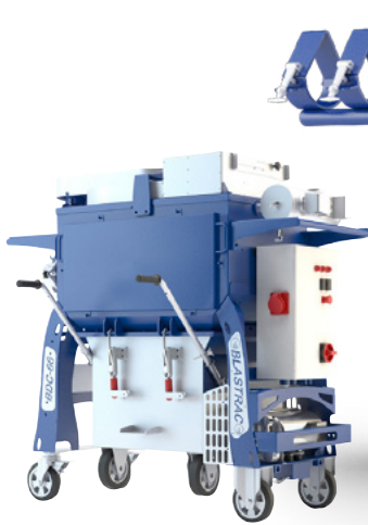
BDC66H Dust Collector