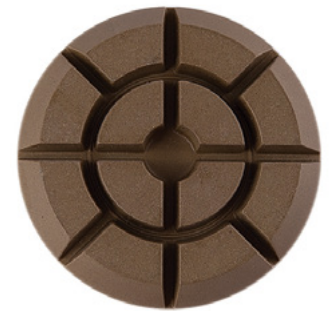
1649-6097 Stonecrete SC-3rhc0050 3" Resin Hard Concrete 50, 100, 200, 400, 800, 1500, 3000 Grit