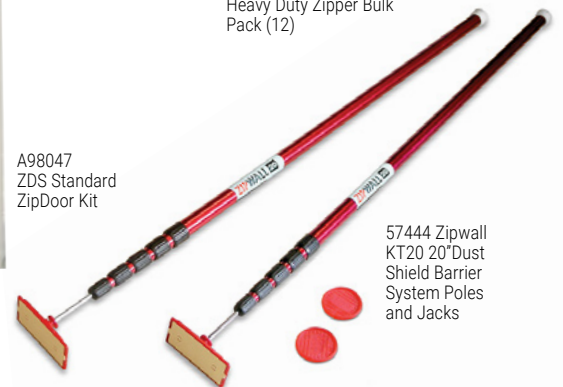
57444 Zipwall KT20 20' Dust Shield Barrier System Poles and Jacks