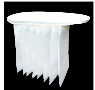
A16919 Ruwac 30091 Primary Filter for 3 Motor Vacuum 28 Sq. Ft.