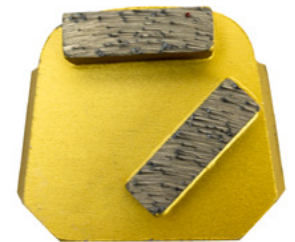
2635-1027 Truloc 2-Seg, 16 Grit, Soft Bond (Gold)