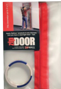
A98047 ZDS Standard ZipDoor Kit