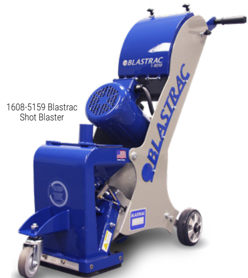
1608-5159 Blastrac Shot Blaster