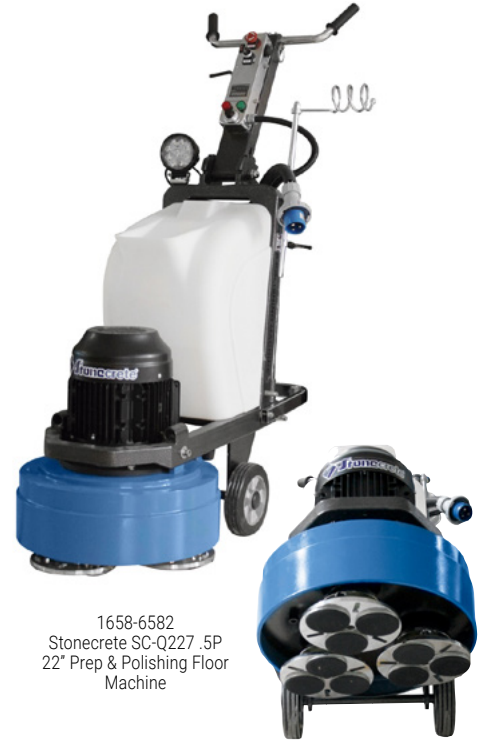
1658-6582 Stonecrete SC-Q227 .5P 22" Prep & Polishing Floor Machine