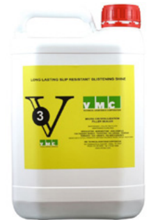
1682-7836 VMC V-3 Chemical