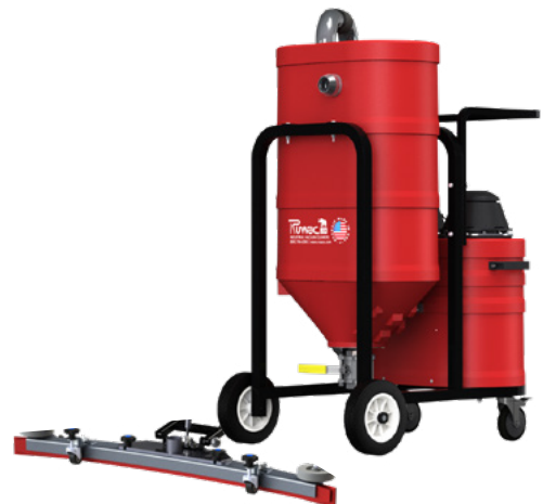
2632-0616 Ruwac Slurry Pro with 1630-9748 Ruwac 42" Floor Squeegee