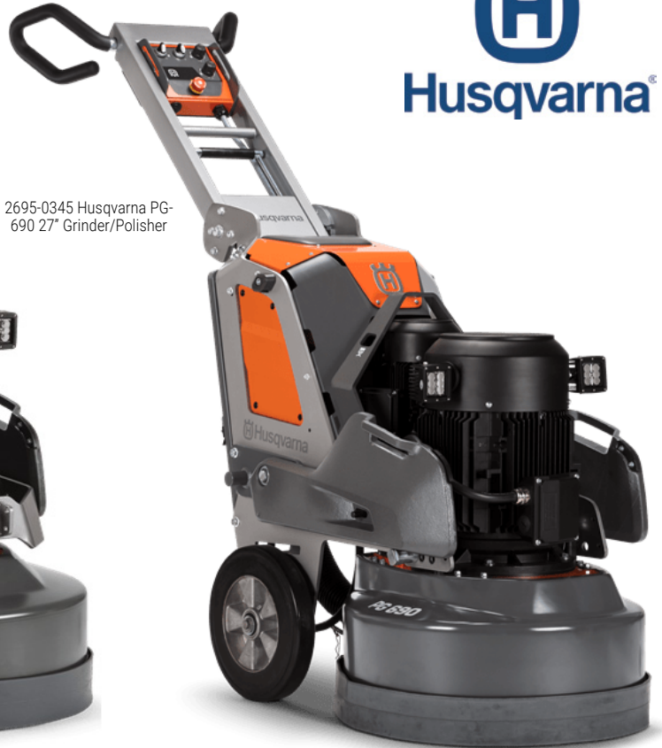
2695-0345 Husqvarna PG- 690 27" Grinder/Polisher