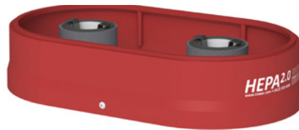
1663-5435 Ruwac Complete Silica Dust HEPA 2.0 Module for Little Red & Quiet Red