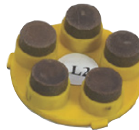
1642-7736 VMC Raptor L2, Velcro