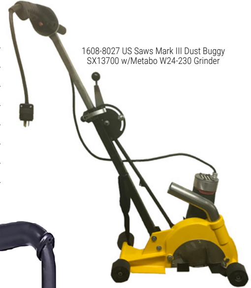
1608-8027 US Saws Mark III Dust Buggy SX13700 w/Metabo W24-230 Grinder