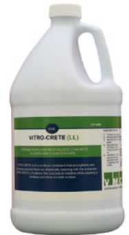
1602-7841 VMC Vitro Crete LL