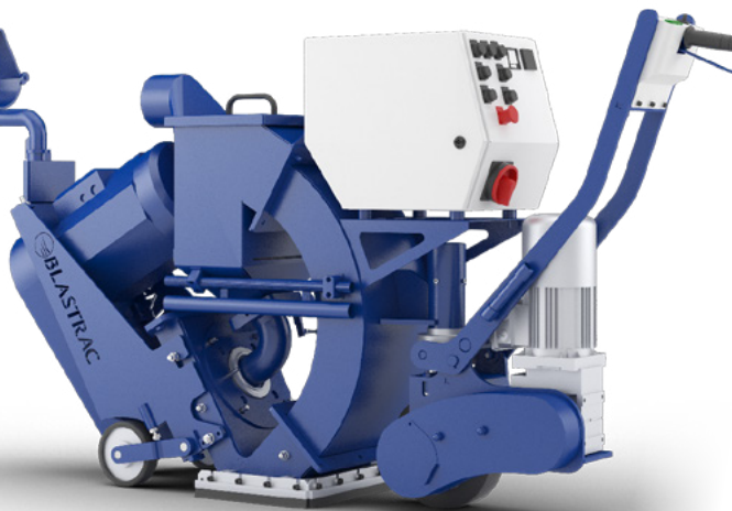
1640-6225 BL-1-10DSG1 Self Propelled Shotblaster