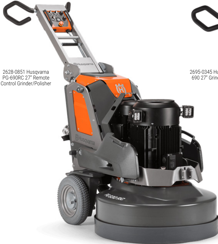
2628-0851 Husqvarna PG-690RC 27" Remote Control Grinder/Polisher