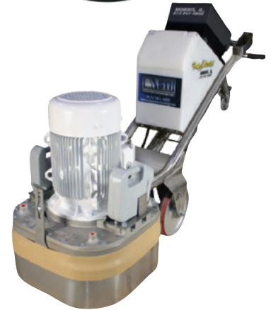
A42231 STI 2420 PrepMaster 24in Head Grinder Polisher