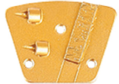
1613-6590 Stonecrete SC-PCD2RECT-L Coating Removal Cutter