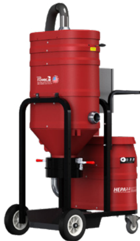
1645-8337 Ruwac Patriot Pro Double Stack Bagger