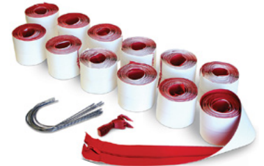
A99025 Zipwall HDAZ12 Heavy Duty Zipper Bulk Pack (12)