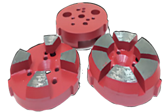
1648-7035 Bullseye 20, 50 or 100 Grit