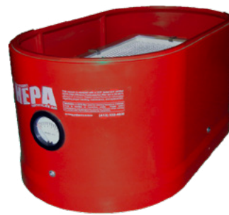
A39125 Ruwac Complete HEPA Maxx Filter Module for Little Red, Quiet Red, & Red Raider