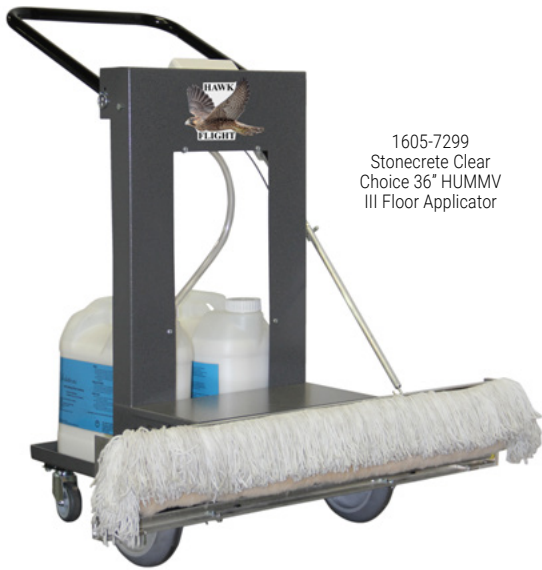
1605-7299 Stonecrete Clear Choice 36" HUMMV III Floor Applicator