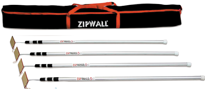
1653-2677 Zipwall SLP4 12' Dust Shield Barrier System