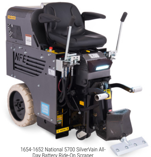
1654-1652 National 5700 SilverVain All-Day Battery Ride-On Scraper