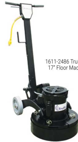
1611-2486 TruBrand 17" Floor Machine