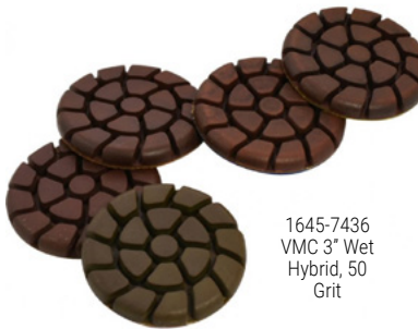
1645-7436 VMC 3" Wet Hybrid, 50 Grit