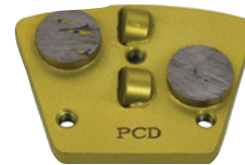
1645-7234 VMC PCD Trapezoid