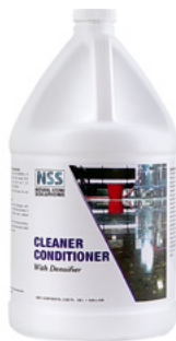
1652-6194 Stonecrete Clean01-C Cleaner Conditioner Densifier Concentrate