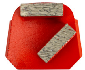
2637-1029 TruLoc 2-Segment Grinding Disc 16 Grit Medium