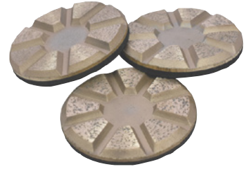
1691-7825 VMC Metal Tullip Diamonds