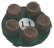
1641-7735 VMC Raptor L1, 25 Grit, Hybrid Diamond, Velcro Backed