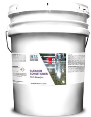
1655-6298 Stonecrete Clean01-C Cleaner Conditioner Densifier Concentrate