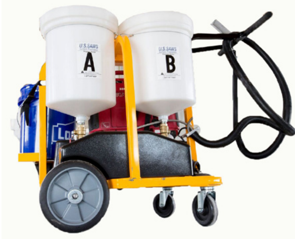
1609-6024 US Saws SX20500-Dual Component Polymer Pump