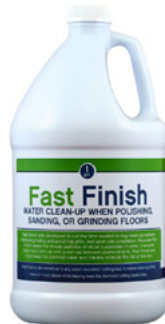
1687-7932 VMC Fast Finish