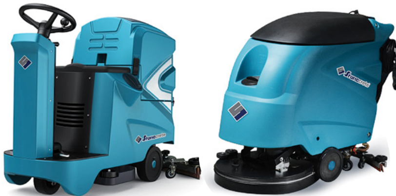
2647-0120 Stonecrete SC-SDT45-50 Scrubber Dryer