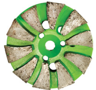
1686-6384 Stonecrete SC-3HCSP016 3" Hard Concrete Metal Spiral Round W/Pin 16 Grit