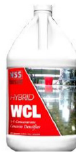
1643-6394 Stonecrete Chybrid01 Hybrid WCL Densifier Concentrate