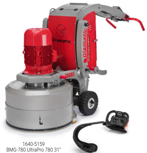
1640-5159 BMG-780 UltraPro 780 31" Planetary Grinder/Polisher