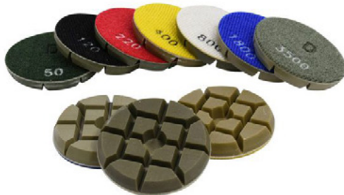
1648-7338 VMC Conquer DIA Abrasive 3"