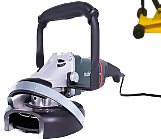
1651-6320 SX60006PPG2 7" Pro Grinder Vac with Metabo W24-230