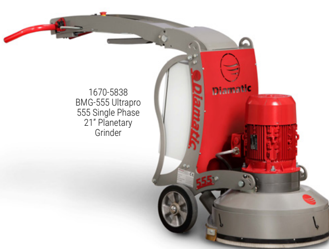
1670-5838 BMG-555 Ultrapro 555 Single Phase 21" Planetary Grinder