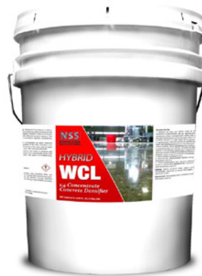
1645-6598 Stonecrete, Hybrid WCL Densifier Concentrate