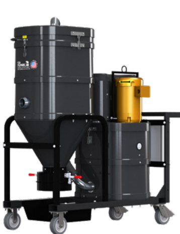
1612-8732 Ruwac Powerhouse Bagger