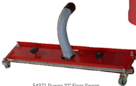
54371 Ruwac 32" Floor Sweep Tool with 2" Hose Connection