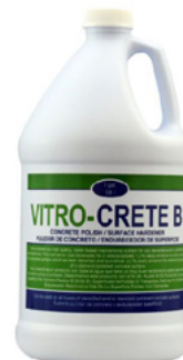
1608-7241 VMC Vitro Crete B