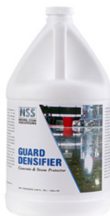
1640-6694 Stonecrete Guard01-RTU Concrete Guard with Densifier