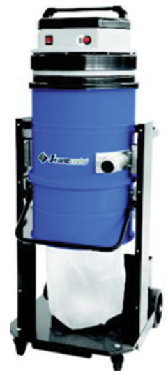
1627-6697 Iclean Industrial Vacuum