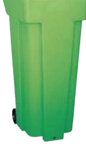
Disposal Cart Shown

Porta-Stream® I: 6 minutes flush time, holds 6 gallons Eyesaline® at ambient temperature. Includes 70 oz. bottle of Eyesaline® Concentrate to be mixed with water and 8 x 10" vinyl eyewash sign. ANSI Z358.1. Classified personal.