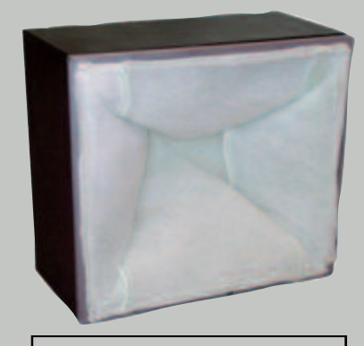
General Purpose Filter Kit Part # F4000