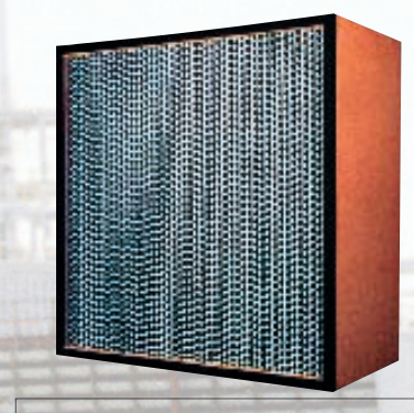
Replacement Hepa Filter