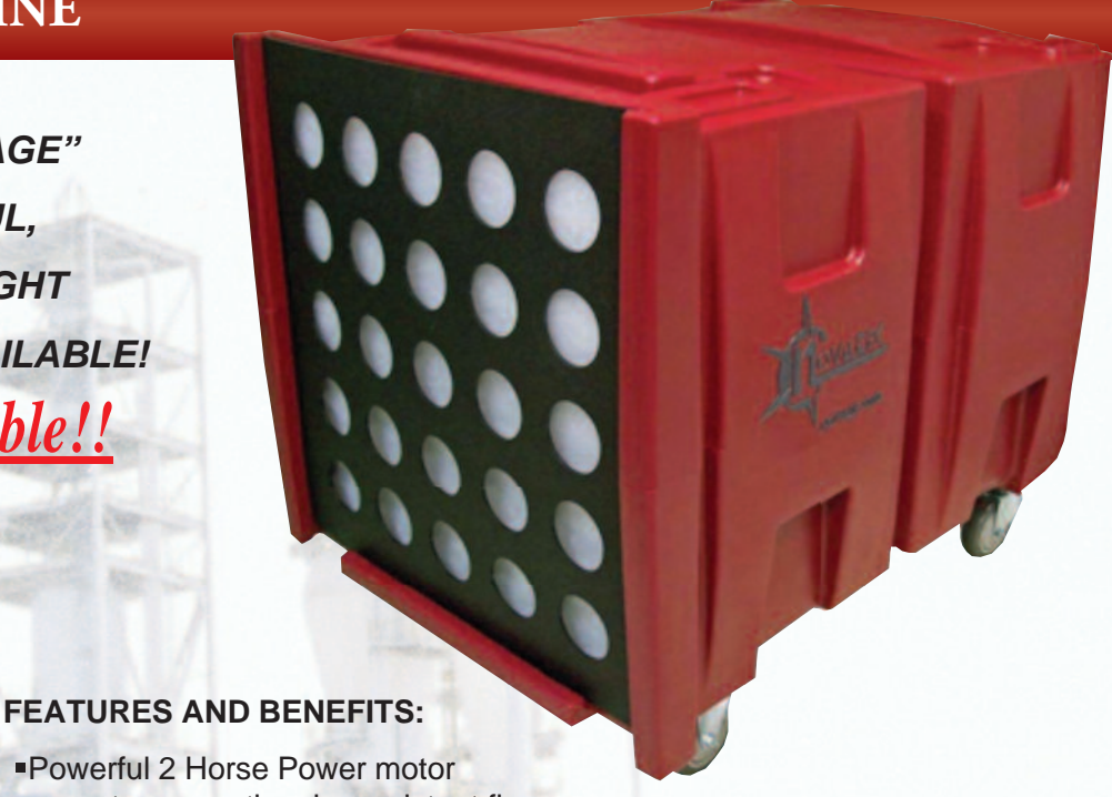
■Powerful 2 Horse Power motor