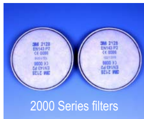
2000 Series filters

NOTE: The printed side of the 5925 filter goes to the 60xx filter and the the 501 retainer clips over the filter casing.