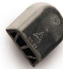
Auer Exhaust Valve

Conduct inflation tests according to ASTM F1052, “Standard Test Method for Pressure Testing Vapor Protective Ensembles”. A