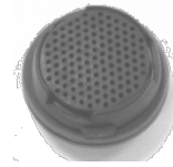
Pirelli Exhaust Valve

copy of the standard may be obtained for a fee from ASTM ( www.ASTM.org ) or by calling (610) 832-9585.