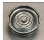
Properly installed Auer exhaust valve diaphragm (outer cover of exhaust valve not shown)

The diaphragm in each exhaust valve must be replaced by the end user every two years from date of manufacture. Instructions on purchasing replacement exhaust valve diaphragms can be found on-line at www.personalprotection.dupont.com or by contacting DuPont Customer Service at 800-931-3456. Instructions for replacing the exhaust valve diaphragm can be found in the DuPont Personal Protection Instruction Manual for Universal Pressure Test Kit .