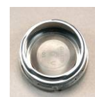
Properly installed Pirelli exhaust valve diaphragm (outer cover of exhaust valve not shown)