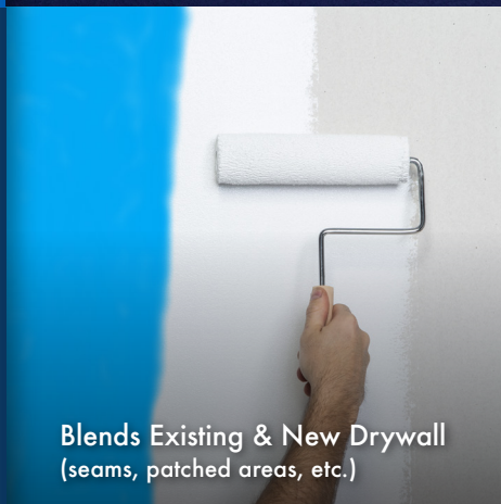
Blends Existing & New Drywall (seams, patched areas, etc.)