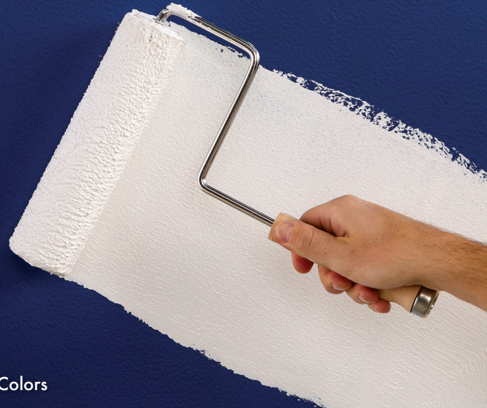
Hides Previous Colors