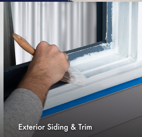
Exterior Siding & Trim