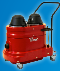
WNS2220 "Little Red"