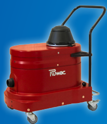
WNS1000 "Baby Red"

...Plus, our three-year filter life guarantee