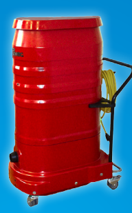
WS2320 "Red Raider"