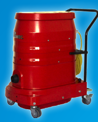
WS2220 "Quiet Red"