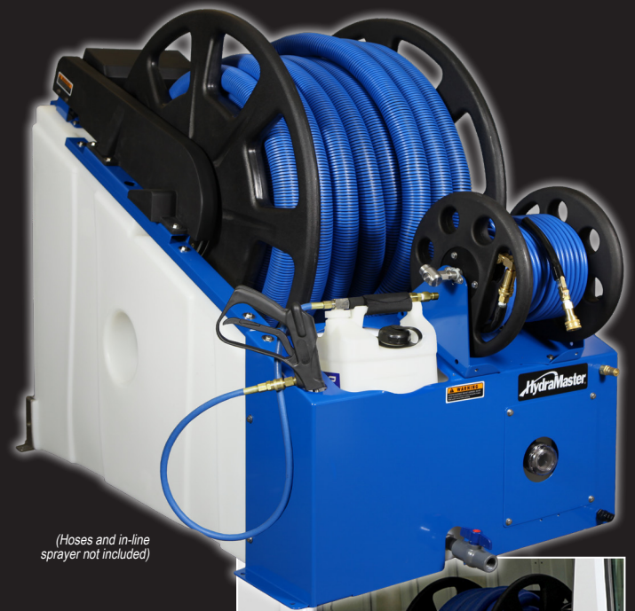
(Hoses and in-line sprayer not included)