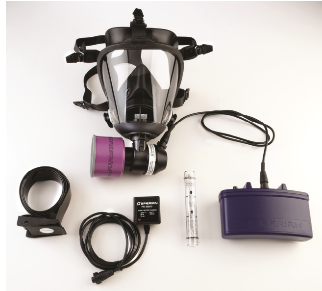
PR500 Series Face-Mounted PAPR

The APF for the PR500 Face-Mounted PAPR is 1,000.