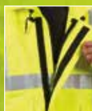
Zipper front closure with hook and loop storm flap prevents liquids from sneaking in