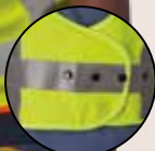
Adjustable Snap Sides