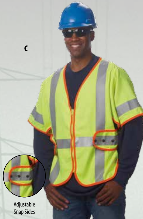
Adjustable Snap Sides