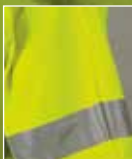
Jacket and Pant garment seams are stitched and HF sealed to prevent liquid penetration