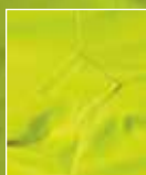
Innovative DRP™ Diamond Reinforced Patch to prevent crotch “blow out”