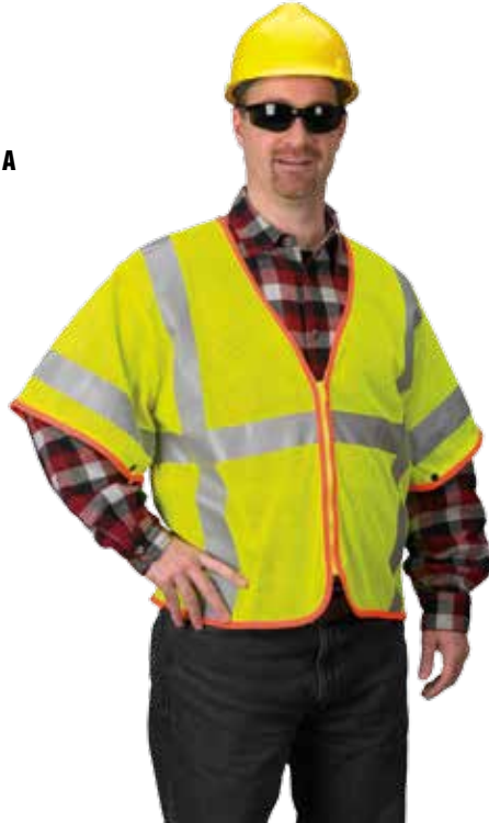
A. Style V-10AM2023ZL Class 3 Vest with Lanyard Port