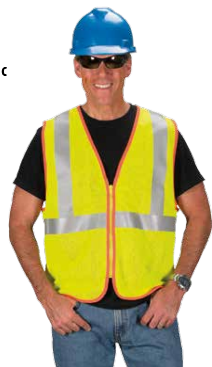
C. Style V-10AM0122ZL Basic Class 2 Vest