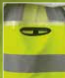
Reinforced lanyard opening