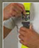
Non-metallic quick release bib pant strap clips