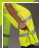
Leg zipper for easy donning and doffing over boots and work shoes.