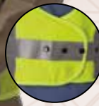
Adjustable Snap Sides