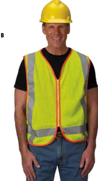
B. Style V-10AM0322ZL Non-conductive Zipper Closure