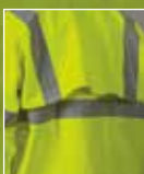
Ventilated jacket back