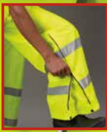
Leg Zippers for Easy On and Off!