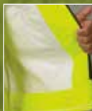
3" internal anti-wicking dam on bottom of jacket and pants to prevent internal moisture migration