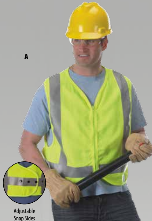
Adjustable Snap Sides