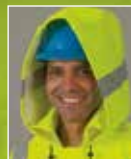
Over-size jacket hood with adjustable draw string fits comfortably over a hard hat