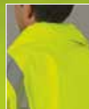
Jacket collar with self-stowing hood storage